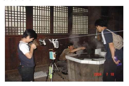
Students setting up monitors near stove

life through integrated utilization of rural renewable energy technologies and products. Indoor air quality monitoring was included in the project for quantifying the effect of rural renewable energy promotion in demonstration sites, as well as, providing accurate and scientific data for environmental improvement evaluation of the Project. This IAQ monitoring will be conducted twice, both pre and post demonstration constructions.