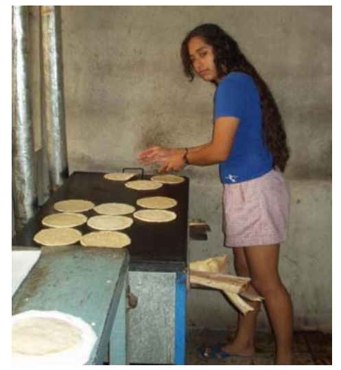
Using Ecostove in Nicaragua

Trees Water and People (TWP) and its partner PROLEÑA/Nicaragua have successfully completed the first phase of the Pro-Tortilla project. The project, which received support from the U.S. Rotary Club and The Ashden Foundation, provided subsidies of 30-58% for 800 Ecostoves for small household businesses in Nicaragua. Of these businesses, generally run by single mothers, 70% make tortillas and the rest make other types of food. The businesses usually operate 6-12 hours per day, cooking over traditional open fire stoves, which results in a hot and smoky working environment, low hygiene levels and high fuel costs. According to a follow up survey, 76% of the 800 businesses which adopted Ecostoves were motivated by a desire to eliminate indoor smoke, 20% to reduce high fuel costs, and 4% to avoid trouble with neighbors due to outside smoke.