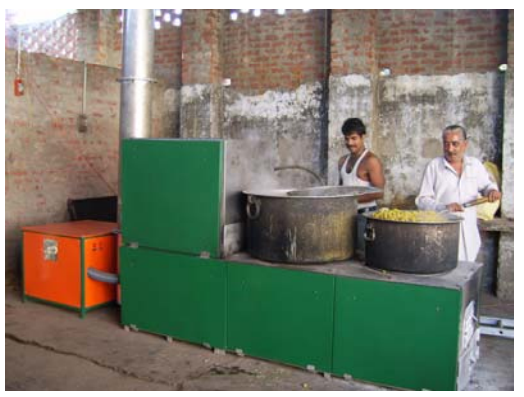
The Sanja Chula in India, cooking meals for school children. It runs on biomass briquettes, has a fan to assist the initial stages of combustion until it is hot and has replaced LPG.

There are two main issues relevant to carbon funding. Firstly, is the fuel used unsustainable? If wood is stripped for cooking faster than it is being replaced, then the biomass is unsustainable and there is a net emission of CO<sub>2</sub>. Our first project in 2003 supported NGOs in Bangladesh to extend their programmes. Although the intention had been to run the programmes in areas where the main source of fuel was wood indeed from unsustainable sources, it turned out that most users were using crop waste and twigs, which are renewable. Although the stoves reduced fuel used, it was much harder to prove emissions reductions. In Madagascar and Honduras we liaised closely with the project developers to ensure that the main fuel used was coming from non-renewable wood - being cut down and not replanted. We had to pull out of a fuel-switching project at an industrial plant in Costa Rica because we could not prove the source of the wood. In Madagascar there is anecdotal evidence