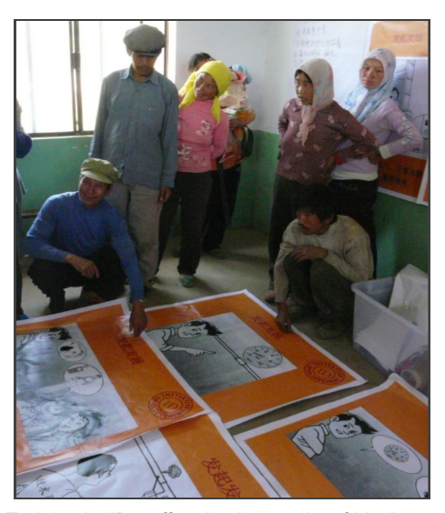
Training by ID staff on basic security of biodigester maintenance and operation

sessions on a periodic basis, to very closely monitor the quality of the construction and to put in place a maintenance system to diagnose and repair any failures that might happen during the 10 years following the construction.