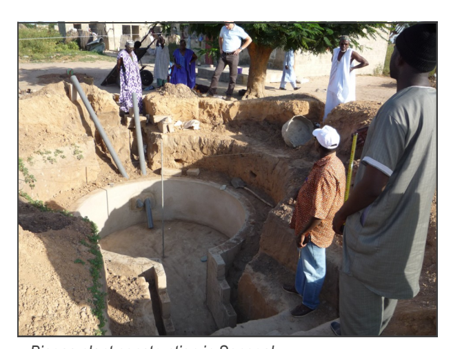
Biogas plant construction in Senegal

Netherlands government and managed by Hivos. Together, these programmes in Africa aim to support construction of well over 70,000 domestic biogas installations by the end of 2013. Compared to Asian countries, biogas development in Africa has been pretty modest so far because of various challenges, especially, the high investment costs, limited access to credit facilities, insufficient awareness raising activities and significantly lower purchasing power of potential households.