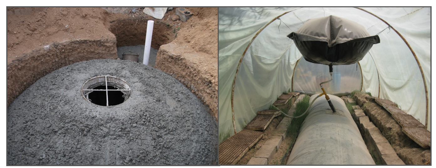
Biogas digesters in China (left) and Mexico (right)