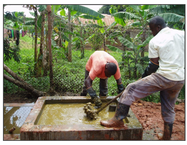
Mixing cow manure

The Centre for Research in Energy and Energy Conservation (CREEC) is an organization for research, training and consultancy, located at the College of Engineering, Design, Art and within Makerere University. CREEC's mission is to enhance access to modern types of energy through research, training and consultancy in East-Africa. The centre focuses on four areas: bioenergy, solar PV, pico-hydro and energy management.