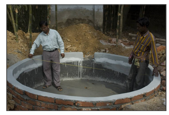
Biogas plant construction in Bangladesh

More information about the E4ALL Working Group on Domestic Biogas is available at <a href="http://www.energyforall.info/files/Domesticbiogas.pdf">http://www.energyforall.info/files/Domesticbiogas.pdf</a>