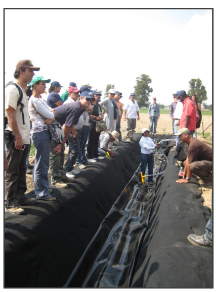
RedBioLAC IRRI biogas installation

Latin America and the Caribbean have significant potential to tap biogas technology to utilize abundant organic waste from livestock to reduce the use of increasingly scarce firewood. There are a number of strong groups working with the small-scale biogas technology in the LAC region, however barriers include: 1) isolated biogas projects with limited information sharing; 2) limited LAC based research on the efficient use and associated benefits of biodigesters; 3) the lack of sustained, long-term institutional support; and 4) socio-economic challenges with the adoption of the technology in rural Latin America.