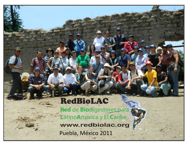
RedBioLAC group photo—Mexico conference

invited to join the network as participants and may attend RedBioLAC conferences and participate in the listserve discussions. Member organizations make decisions about future activities, assist in international research, participate in virtual meetings, review technical documents, and are included in the RedBioLAC directory. Prospective members or participants can find more information or join RedBioLAC online at <a href="https://www.redbiolac.org">www.redbiolac.org</a>.