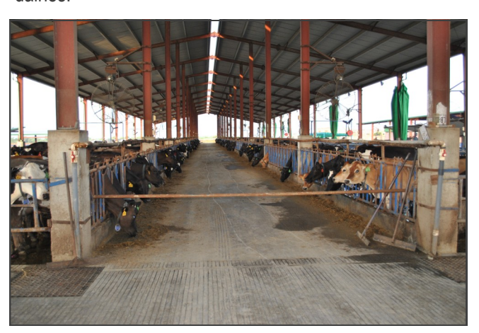
Dairy Farm - Pakistan Commercial Biogas Project

these farm needs may be met from this self generation of electrical power at a very economical rate. The energy demands of a typical medium—to-large dairy farm include: electricity to run milking machines, operate chillers, pump water, and provide lighting and fans in barns, offices, and residences. In addition, a significant amount of thermal energy is required as a cooking fuel for labor intensive dairy farms. Such needs can be successfully fulfilled through the application of biogas. In addition to meeting energy needs, biogas digesters can also convert large volumes of dairy manure into a readily usable fertilizer for application on fields around the dairies.