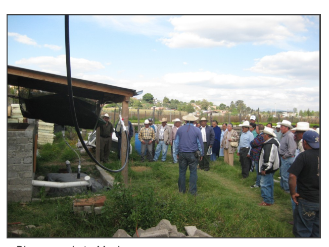
Biogas market - Mexico

It starts with a reliable technology—Biobolsa is a highly durable geomembrane digester—but this is just the start. Sistema Biobolsa is more than merely a product: it is a