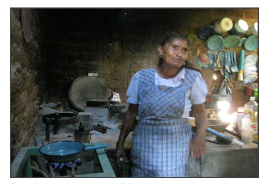
Cooking with biogas - IRRI Mexican Biogas Program

Let the People Choose: Many people ask how we choose our end users: we don't. Our program is oriented to take advantage of the market, not because we are opposed to state funding, but because we have learned that if the people choose to have a Biobolsa, and commit to purchasing one, then the likelihood that it will be adopted and maintained is higher. The responsibility of the program is to demonstrate the benefits and eliminate the barriers that are inhibiting families from choosing to have a digester.