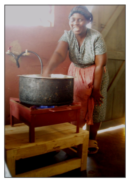
Cooking with a smile

is able to save approximately USD $870 every year by using biogas for cooking. The money saved from having the biogas unit will go directly towards improving services, accommodation facilities and to support more orphans.