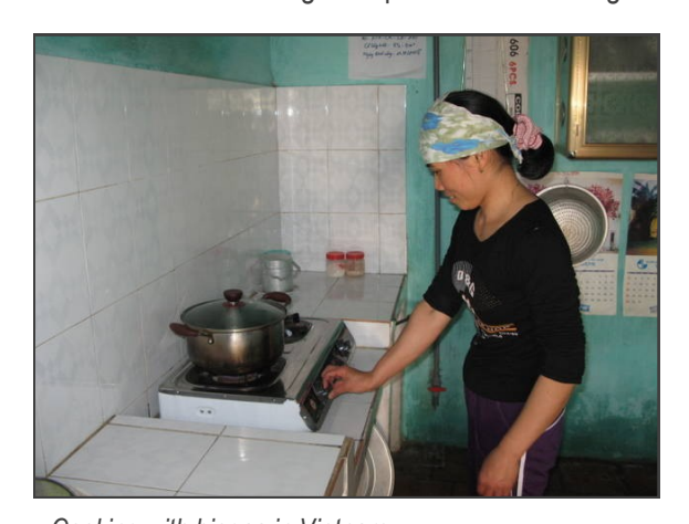
Cooking with biogas in Vietnam

studies and/or resource mobilisation are ongoing in other potential biogas countries including Sri Lanka, Myanmar and the Philippines.SNV Netherlands Development Organisation was invited by the Steering Committee of E4ALL to lead a Working Group on Domestic Biogas.