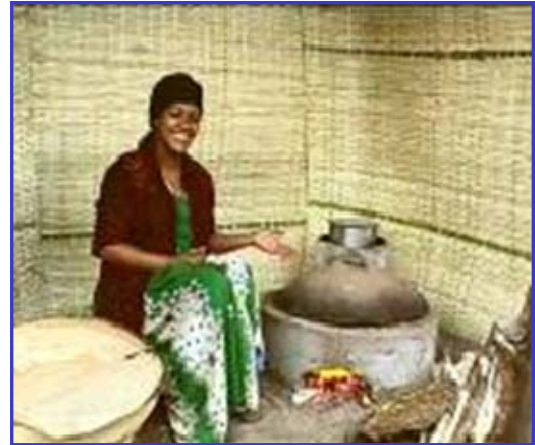
An Ethiopian woman making injera on her Mirt Stove

What are you most looking forward to about the upcoming 2009 PCIA Forum? I am looking forward to meeting with people from different organizations that have outstanding results in the household energy sector. I also look forward to discussing possible ways of collaboration and integration for the future.