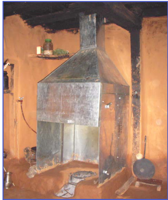
Intervention (smoke hood and stove improvement) in a household in Dhading District, Nepal

How has winning a PCIA Award helped you to promote your program? Winning a PCIA award has helped raise our profile and gain recognition among different communities including international donors (we secured European Union funding to initiate IAP reduction work in peri-urban areas in Nepal). It has helped promote our approaches among other Forum members through other platforms such as Better Air Quality 2008 and the UN Commission on Sustainable Development 2007.