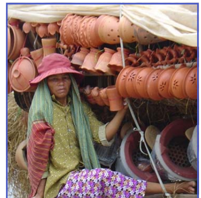
GERES Cambodia improved stove distributor

What advice do you have for others in the household energy and health field? Develop and introduce affordable ICS with designs that are simple and easy to operate by the average person in your target areas. It's important to collaborate in close partnership with the private sector to produce and distribute the ICS, so when the business reaches its maturity, the private sector will ensure sustainability. Collaborate in close partnership with the relevant government institutions to assure the quality of the ICS and make sure to set-up a thorough monitoring system and mechanism to permit regular and updated feedback from the users and the markets.