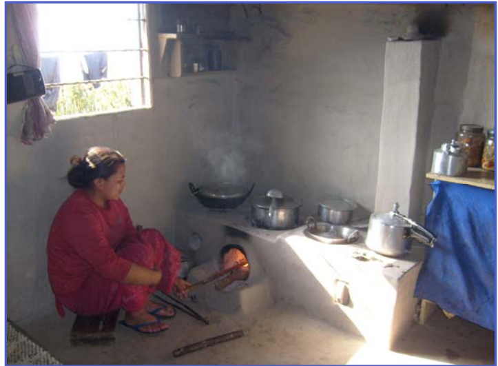
Improved cookstoves in Ilam district

What advice do you have for others in the household energy and health field? Although it is not easy to convince people who have been using traditional cooking from generation to generation, have patience!