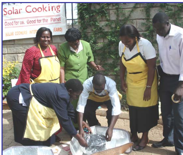
SCI Team demonstrating solar cooking

What advice do you have for those still deciding whether to come to the 2009 PCIA Forum? Imagine! Who will play your role - you make up the strong, reliable 240 member team, your absence will make our team lose. Hurry up and register! Let's meet and share, as we energize and synergize one another. See you in the land of the white crested cranes soon!