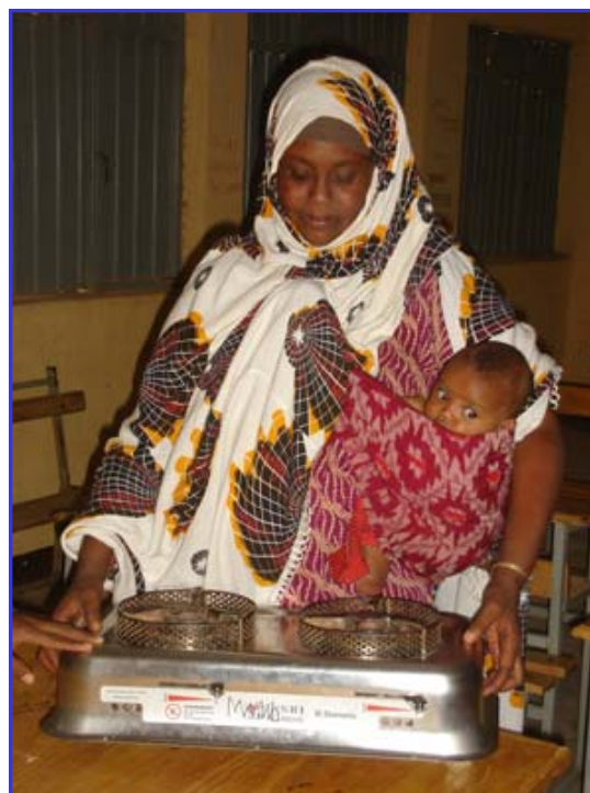
Woman learning to use a Clean Cook stove