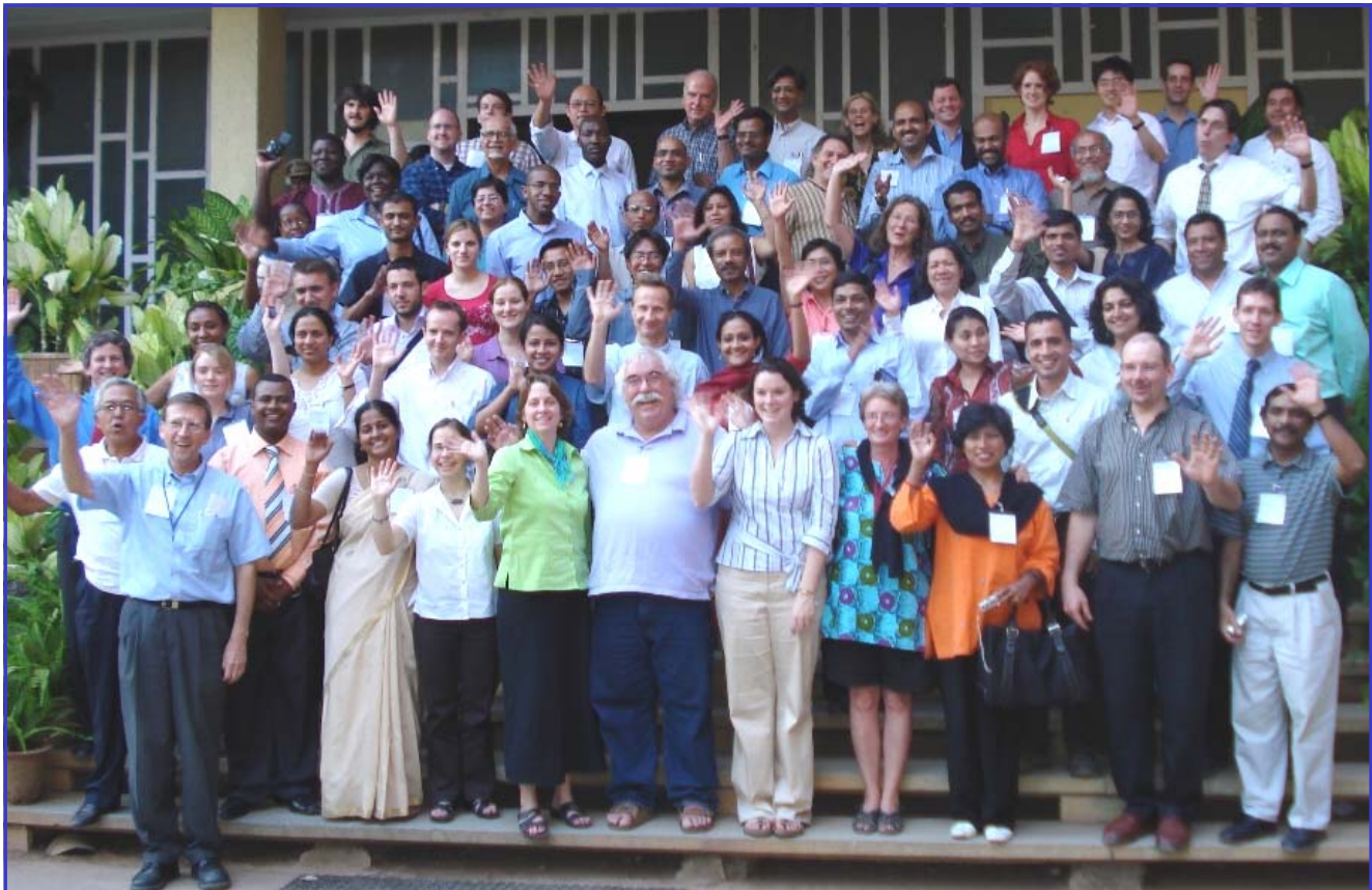
2007 3rd Biennial Forum

The 2007 award winners agreed to share some insight with us prior to this year's Forum. On the following pages you can read their interviews, learn about their projects and latest work, and hear their opinions on why travelling to Uganda and attending the 4th Biennial PCIA Forum will be a rewarding experience for you!