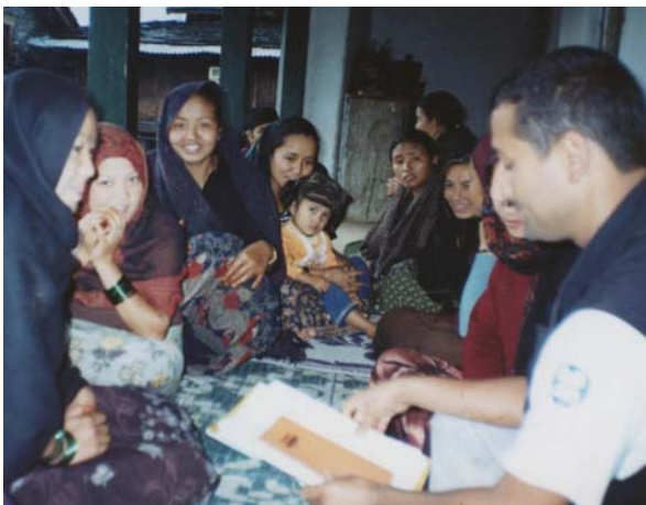
Awareness program in Gorkha district, Nepal

How has being a PCIA Partner helped you in your work? It has helped build linkages with many other agencies working to improve indoor air quality and health - getting their technical and advisory support. For example, we now have a linkage with Aprovecho Lab for testing the efficiency and effectiveness of the smoke-hoods that we are promoting.