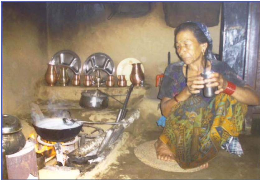
A lady boiling milk using a traditional stove (metal tripod)

What advice do you have for those still deciding whether to come to the 2009 PCIA Forum? The PCIA Forum has been very instrumental to me for my personal growth, has broadened my knowledge on the issues of IAP, and has also been wonderful for my organization in achieving its goals on IAP. Thus, I encourage all to participate and join the network to fight IAP together.