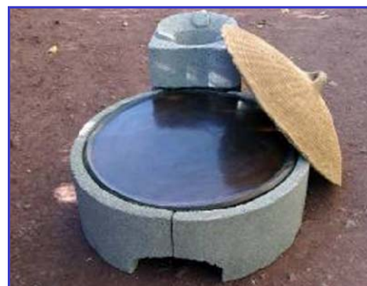
Picture of a Mirt Stove

What advice do you have for those still deciding whether to come to the 2009 PCIA Forum? Use this opportunity to meet key people that are working in the household energy sector for future collaboration and learn from their experience.