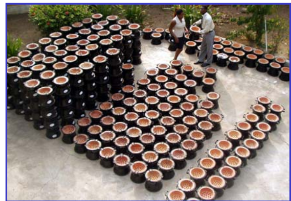
Stock of cookstoves in Uganda

What are your program's goals for the coming 1-2 years? We are currently selling 60,000-70,000 cookstoves per year in only two areas – Greater Accra and Kumasi. The plan is to expand to other areas and by next year, double our sales.