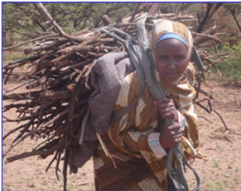
Refugee carrying wood for fuel

What are your program's goals for the coming 1-2 years? To continue to scale-up and/or expand the refugee program to as many households in as many camps as possible. We anticipate that Ethiopia will receive many more refugees in the coming year from Somalia, and we would like to work to ensure they are free from the burden of fuel wood collection and IAP. Perhaps our most focused goal for the next 1-2 years is working to ensure a strong establishment of the ethanol-for-household-energy market, to commence local production of the stove, and to ensure sustainability of the market and fuel supply through continued awareness-building and partnership cooperation. We also hope to continue to produce relevant, quality research (health study, IAP testing, socio-economic assessment, etc.) and to look into possibilities for partnering and scaling-up in other countries.