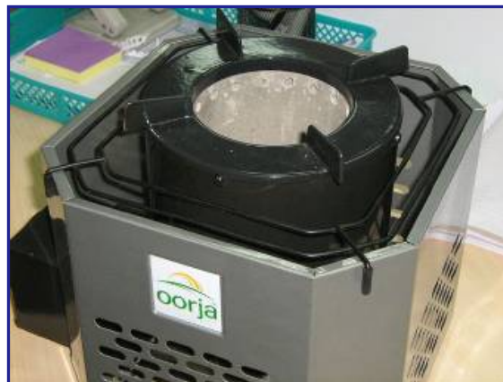
Oorja stove - basic version

Mission: To develop and deploy innovative business and technological solutions to meet current need gaps in the emerging consumer space and to incubate new businesses by matching their needs to existing technology.